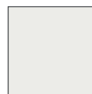
White RAL 9003